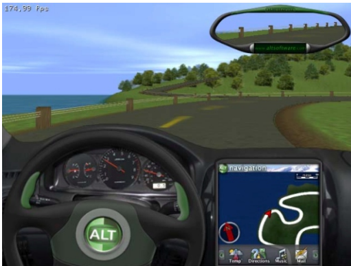
ALT's automotive demo features high performance 3D hardware accelerated and embedded OpenGL